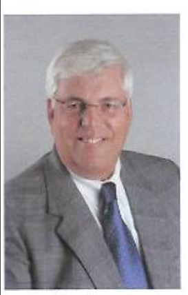
Member NMRA, MCR, Division 5.

you bring with you that do not sell MUST be taken with you when you leave at the end of the meeting. We do not want to make the meeting hall a donation center. **