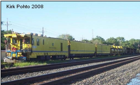
Kirk Pohto 2008

occurrence. The entire unit is self-powered with a converted locomotive sandwiched in the middle providing power.