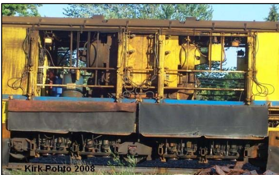
Kirk Pohto 2008