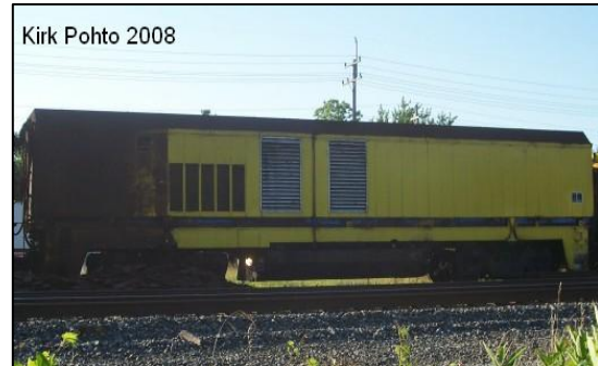
Kirk Pohto 2008