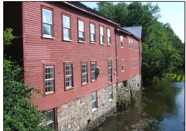
The pictures below are from a grain storage facility near the Depot. The facility is rather large and there were several box and covered hoppers on site.