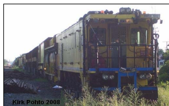
Kirk Pohto 2008