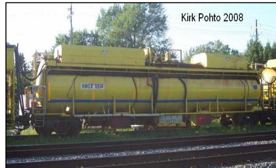
Kirk Pohto 2008