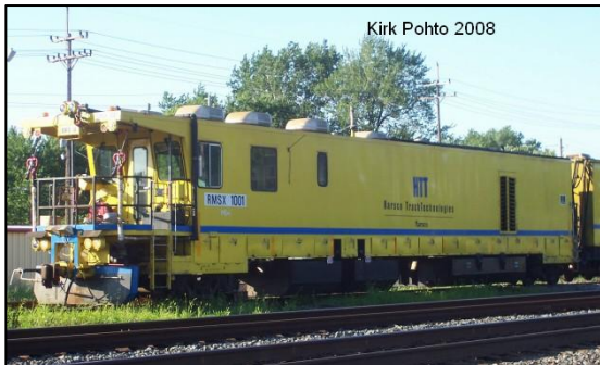
Kirk Pohto 2008