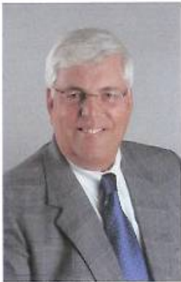
Member NMRA, MCR, Division 5.