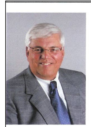
Member NMRA, MRC, Div 5

ou only have until March 9th to get your contest entries submitted. We have five people who have submitted their convention naming ideas. We would like more people to get involved. The rules and entry form were in the January and February Trainwires. Additional copies will be available at the March meeting. You can download the January or February Trainwire from the Div 5 website and get the forms that way. #