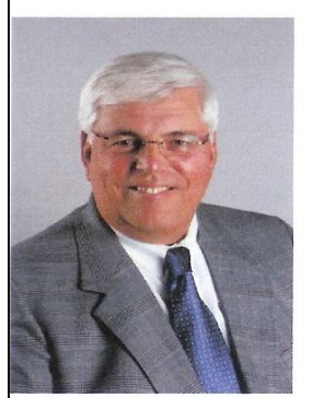
Member NMRA, MRC, Div 5