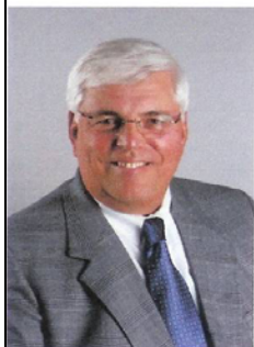
Member NMRA, MRC, Div 5