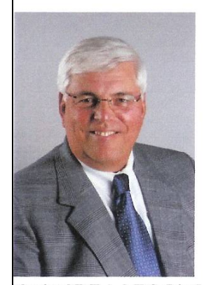
Member NMRA, MRC, Div 5