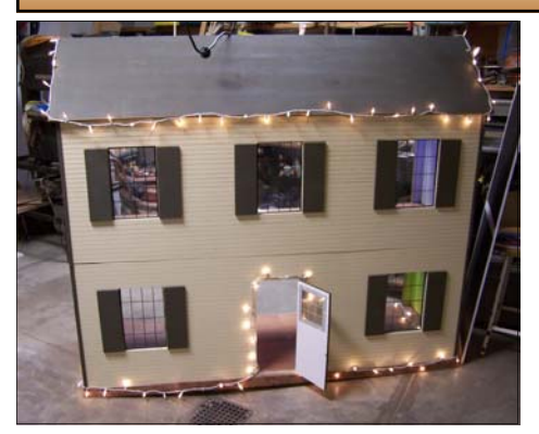
(Continued from page 7)

made completely out of wood. There is also a very detailed trolley system complete with electronics to make several stops