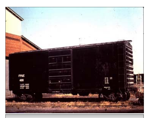
Fig. 1 1 FP&E 400 box car