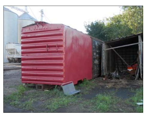
Fig. 6 400 repainted near engine house