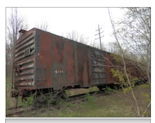
Fig. 3 400 at end of line

n 1973 the Fairport Painesville & Eastern RR bought a box car from the N & W RR. It was originally a Wabash RR car which the N & W acquired when it took over the Wabash. The FP & E needed the box car for moving partial loads from one department to another because other railroads didn't like it that