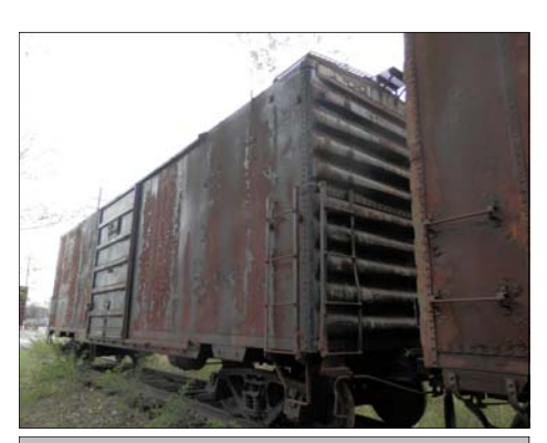
Fig. 4 400 at end of line

used for temporary storage. Last year the AC & J decided to move the cars because of a need to store items near the engine house. The cars were pulled out using a backhoe, the trucks were removed, and the car was repainted (strange color); it now sits across the track from the engine house (fig. 5 - 6).