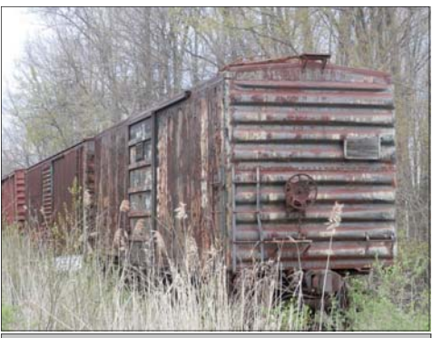
Fig. 2 2 cars at end of line