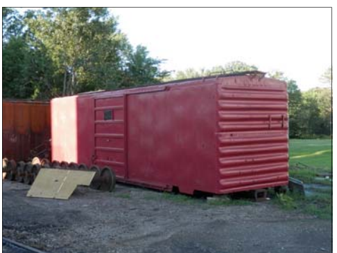
Fig. 5 400 repainted near engine