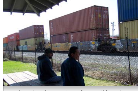
There's always time for Railfanning