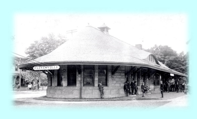
Painesville Depot 1915

Christmas Train and Toy Show Dec. 10, 10am to 3:30pm Lakeland Community College