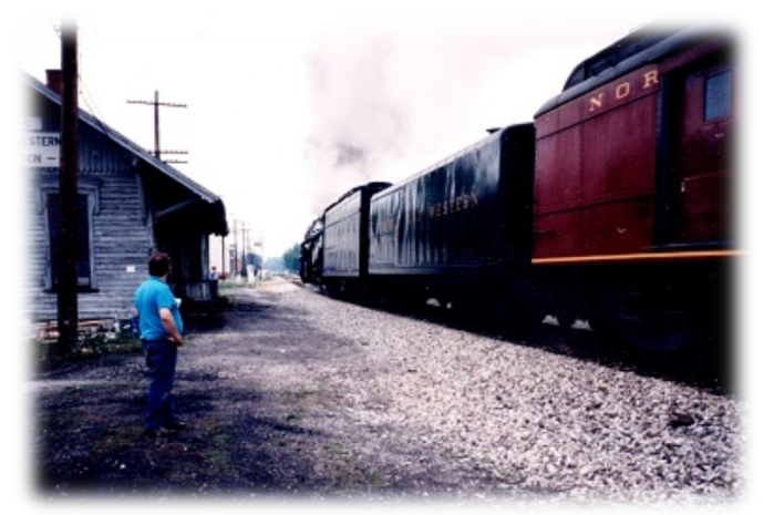
N-W Painesville Station