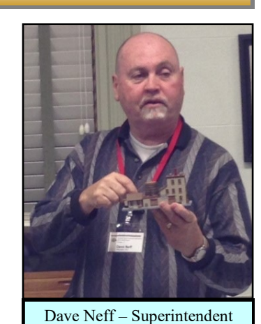
Division 5 NMRA – Mid Central Region

On Saturday November 4 several of our members will conduct the 'multi-clinic' Build a Model Train Layout Day at Lakeland Communiobtain actual progress---and ty College 9-2 p.m. Topics such as benchwork, modulebuilding, plastic/styrene and laser kit building, wiring, trackwork and ballasting, scenery, trees, soldering, DCC and others will be presented concurrently. tendance is FREE so come on out yourself and freshen up on your modeling techniques---and invite friends