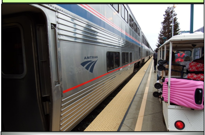
Boarding Amtrak in Seattle, Washington

So if the weather looks bad, and you want to know if the meeting has been cancelled, check on Ch 5 or <u>www.newsnet5.com</u>, click on the weather tab, then the closing tab to see if we are listed. "and will be