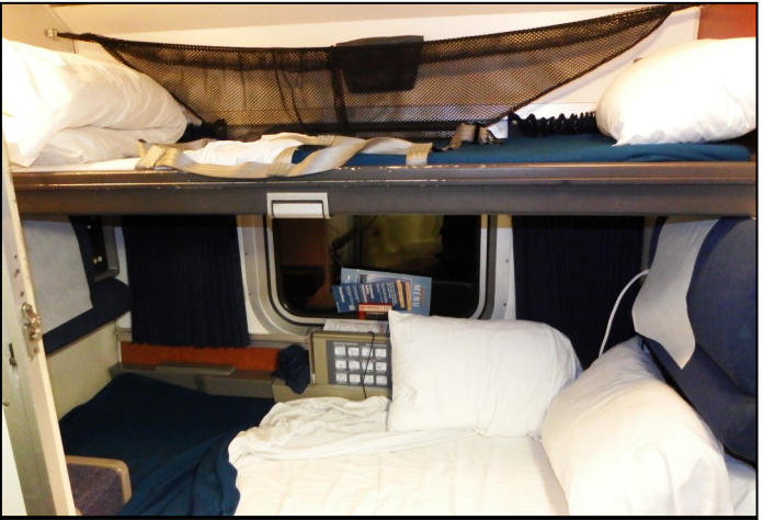
Sleeping accommodations onboard Amtrak.