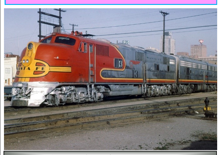
Another Picture from the Internet.

he Trainwire is always looking for an interesting article. If you have taken a trip lately, seen something interesting trackside, have a particular view point on a railroad subject or just want to participate in the Modelers Corner; then we want to hear from you. Everyone wants to be kept current on Division information, but we all enjoy an interesting article written by a member of this organization. So take your pictures and article and send them to the Editor by email and share them will all of us.