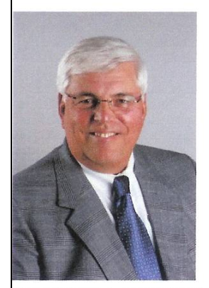
Member NMRA, MRC, Div 5

Next meeting: Monday, September 21, 2009, 7:30 pm at Hambden Town Hall.