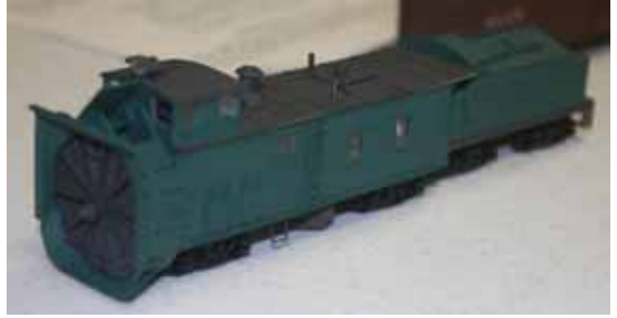
The Trainwire - Page 4 - Mar 2011