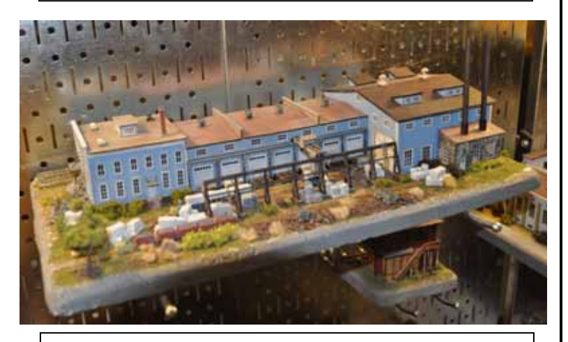
Offerings from N Scale Architect