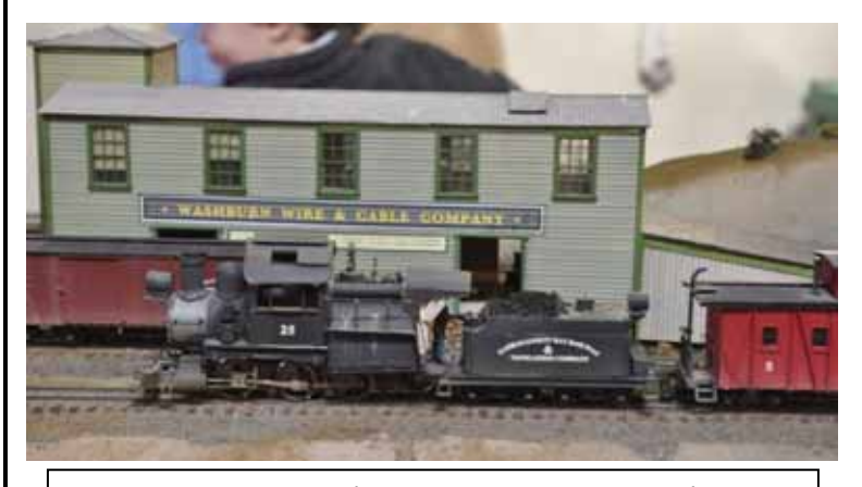
Narragansett Bay Railway & Navigation Company layout

south eastern New England in the 1930's-40s, and used a combination of Bend Track and Free-MO. It was built by members of the Little Rhody Division of the NMRA. All of the power is steam, and the scenery really makes this layout come alive, from the scale coastal steamers to the re-creation of the building of a wooden boat near the rail line.