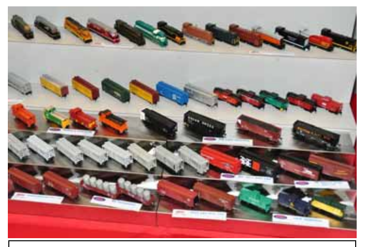
New N scale offerings from Atlas

The show isn't an inexpensive one to attend, with a daily entrance fee of $10 and a parking fee of $5. However, similar to Division 5, the proceeds from the show are used to promote interest in railroads and railroading around the area. According to their website, annual grants and donations have been made to various railroad museums, historical societies, restoration projects and scholarship funds. In addition to those costs, you can also plan to spend additional monies on various food booths, including a few alcoholic libations if you are so inclined.