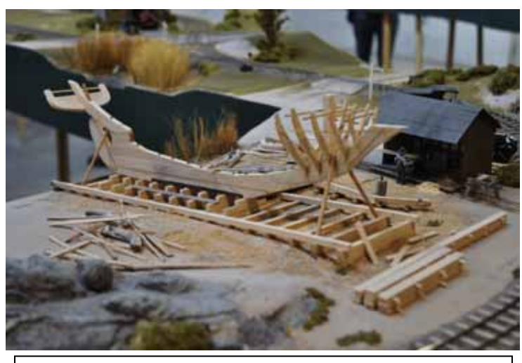
Narragansett Bay Railway & Navigation Company layout

One of the best layouts we saw that day was located in this building, and consisted of the On30 scale Narragansett Bay Railway & Navigation Company. Set in New England, this modular layout narrow gauge RR depicts