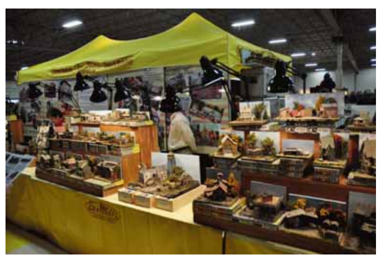
Bar Mills exhibit and products

Our next stop was the Young building, which was marked by a nicely restored speeder setup outside the main doors by the North American Railcar Operators Association. Once inside, such familiar names as Bar Mills, Chooch Enterprises, Carstens, Branch Line Trains, Des Plaines Hobbies, Fox Valley Models, JL Innovative Design, N Scale Architect and Mountaineer Precision Products were displaying their wares, to name just a few. The building also housed some rather large layouts, including three layouts by the