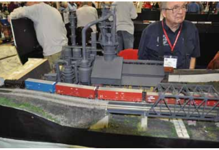
Steel mill on the Hub Division layout