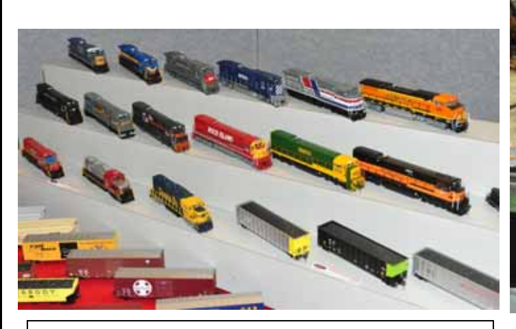
New HO offerings from Atlas