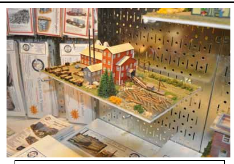
Offerings from N Scale Architect

All in all, this show turned out to be a great way to spend a cold January weekend and I left wishing I could have stayed for the second day of the show. Of course, maybe not attending a second day was OK, as I probably wouldn't have had room in the suitcase and still needed to keep some money available for Railfest 2011.