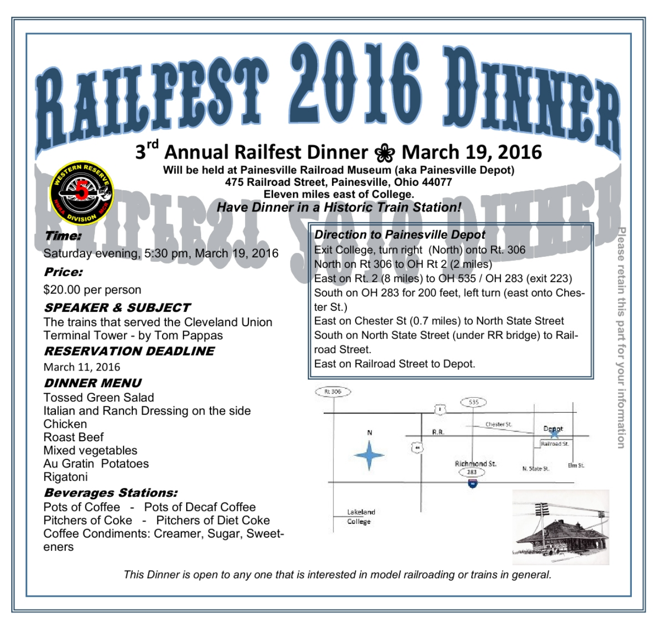
Cut and Return