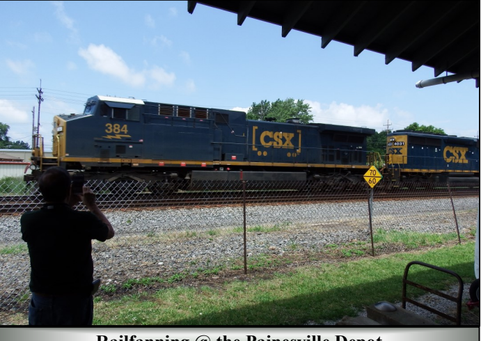
Railfanning @ the Painesville Depot