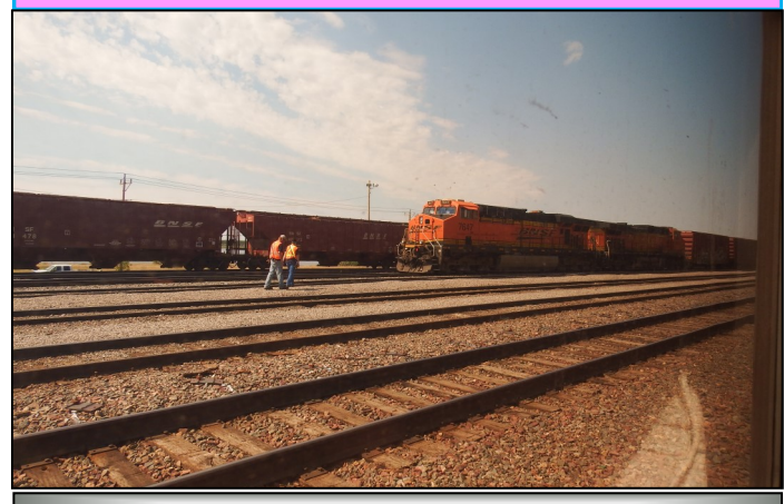
View on the way to Seattle, Washington

he Trainwire is always looking for an interesting article. If you have taken a trip lately, seen something interesting trackside, have a particular view point on a railroad subject or just want to participate in the Modelers Corner; then we want to hear from you. Everyone wants to be kept current on Division information, but we all enjoy an interesting article written by a member of this organization. So take your pictures and article and send them to the Editor by email and share them will all of us.